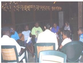
Above: Jost van Dyke residents participate in the April 29th, 2009 Community Meeting which was held in order to get community feedback on the draft Environmental Profile.

“To Preserve, Maintain and Protect the Land, the Environment, and the Culture of Jost van Dyke, British Virgin Islands”