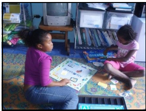
Above: Children playing an educational board game, one of the many resources available in our Environmental Information Centre, housed in the Society’s office on Great Harbour.

The Jost Van Dykes Preservation Society, a BVI non-profit organisation, is dedicated to the preservation of the island of Jost van Dyke—its land, the surrounding sea, its living creatures and its culture through conservation, cultivation, education and research. The Society endeavours to protect key elements of the islands culture and environment for the future generations of all peoples to see, feel, and to understand. In addition to this OTEP-funded project, the Society works to implement other environmental, historical and cultural projects. The Society’s largest and most well-recognised project is a maritime heritage programme that involves the building of Endeavour II, a ‘tradition-inspired’ island sloop (constructed primarily by local high school students.) Once launched, she will be used for sail training, marine sciences education and cultural demonstrations.