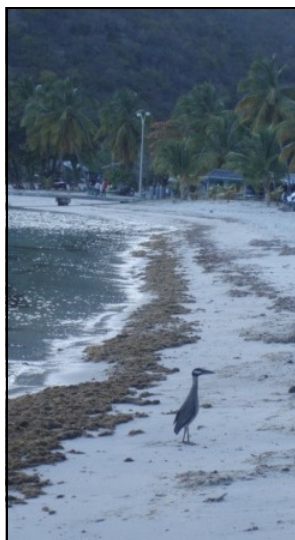
Sights around JVD- like this Night Heron walking along the shore (left) or this Prickly Pear Cactus (right) might be commonplace or 'ordinary' to residents, but many of these aspects of our natural environment are rare or uncommon throughout the world. The Environmental Profile emphasizes some of the unique features of the island.